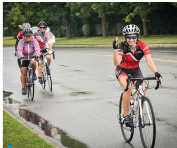
Participants of the 6th One for Youth Bicycle Tour braved the rain for a good cause.