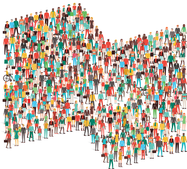
Representation (as at October 31, 2016)

www.nbc.ca > About Us > Social Responsibility > Diversity